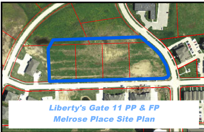
2008 Aerial Photography No scale