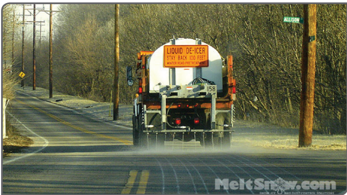
Anti-icing streets before a snow or ice stormstorm. MeltSnow.com