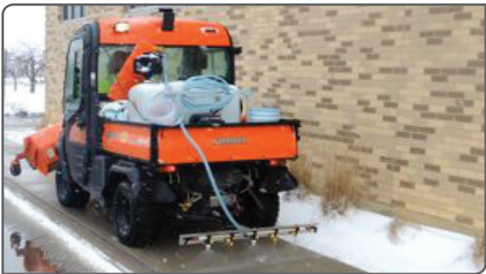
Anti-icing used for sidewalks before a snow storm.

It can improve safety at the start of a storm and can provide more efficient cleanup. According to the MPCA Winter Parking Lot and Sidewalk Maintenance Manual, anti-icing can prevent the formation of frost and be effective for up to several days.