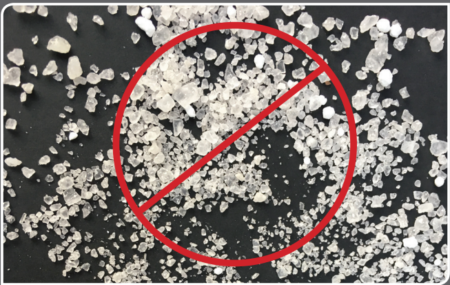
Excessive application of salt deicer for sidewalks, driveways, and parking lots. This can become a slipping hazard.