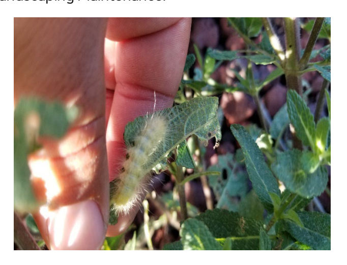
Grasshopper and Caterpillar infestation in our round-a-bouts plants.