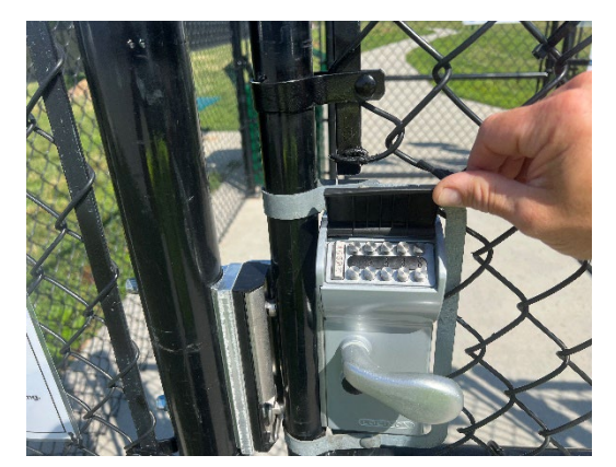
New gate locks installed at Red Fern Dog Park.