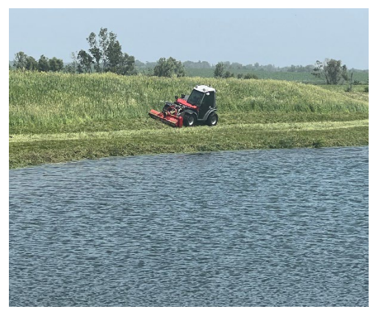
Detention Pond mowing.