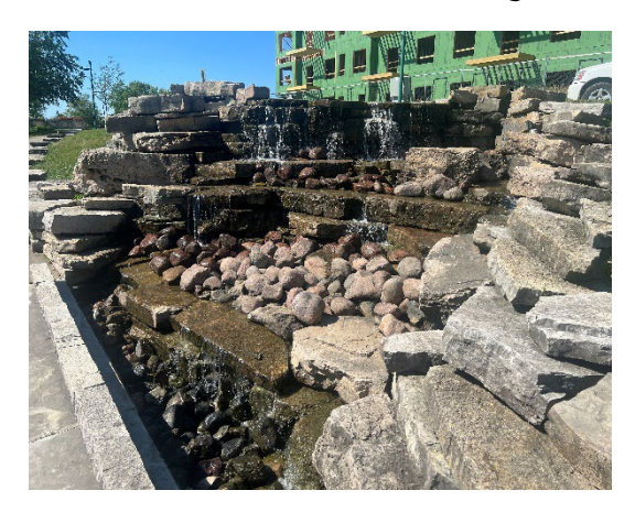
Liberty Centre fountain electrical issue repair and waterfall cleaning and enhancements.