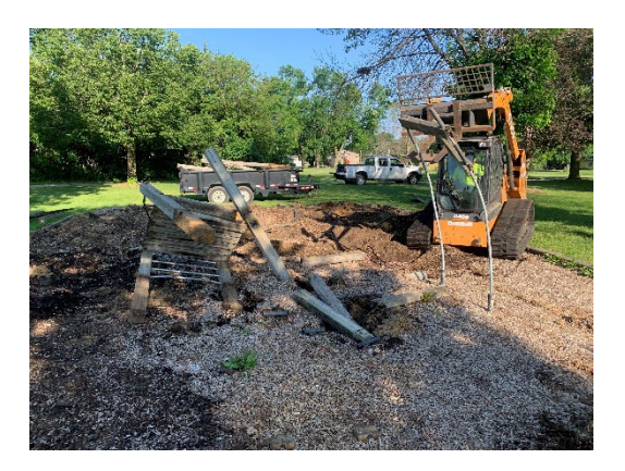
Penn Meadows Park old playground removal.