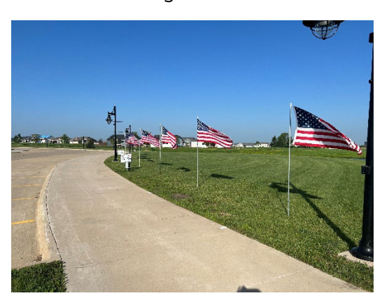
Optimist Club of North Liberty Veterans Memorial flag display at Centennial Park.