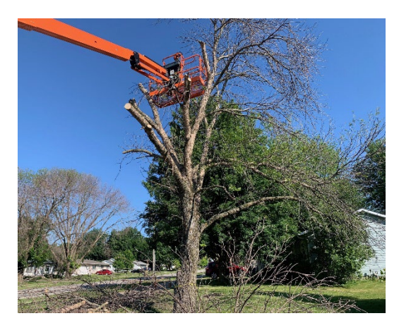
Ash tree removal at Cornerstone Park due to the emerald ash borer infestation.