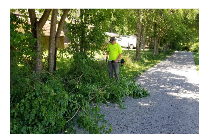
Overgrowth trimmed from the main bike trail.