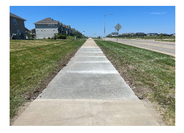
Concrete trail repairs.