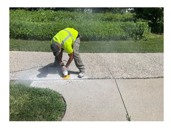
Concrete trail repairs.