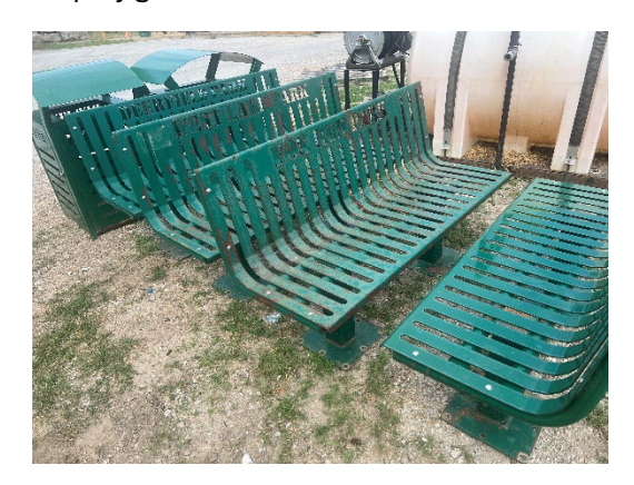
Concrete pads and benches installed.