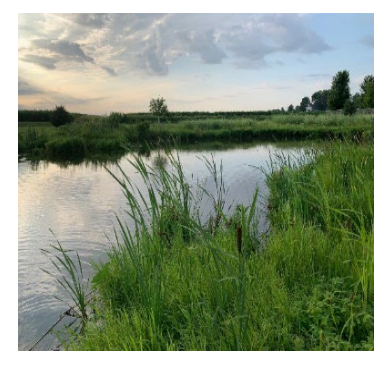
Pond algea before and after benificial pond bacteria treatment.