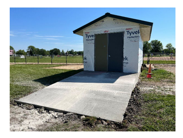
Babe Ruth shed received a new steel standing seam roof, steel doors and a concrete ramp.