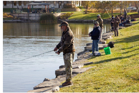
DNR Trout stocking on October 21 st .