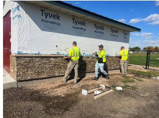
Park staff at Babe Ruth field installing brick and siding on the new shed.