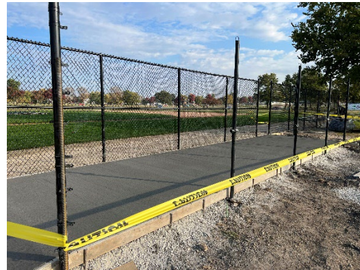
The completed Babe Ruth shed and new concrete dugout improvements.