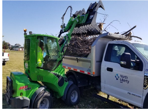
Park Staff cutting down declining Ash trees at Penn Meadows Park.