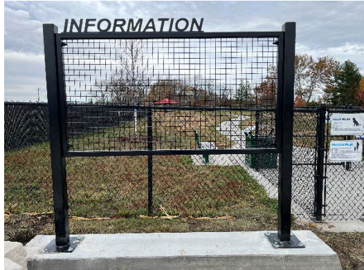
New concrete footings and information kiosks installed at Red Fern Dog Park.