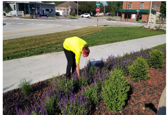
This month we continuously watered landscape areas and weed pulling due to dry conditions.