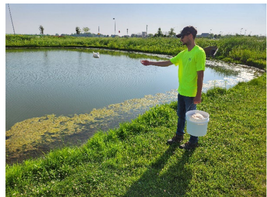
Pond treatment was added to all City owned ponds for algae blooms and water clarity.