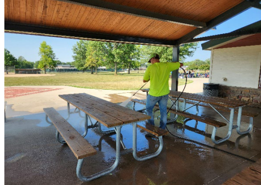
Weekly splash pad and shelter power washing.