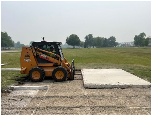
North Penn Meadows Park shelter relocated due to the upcoming parking lot expansion.