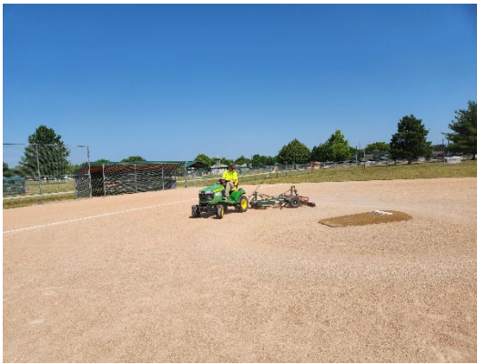
Daily and weekend ball field maintenance.

Planning and preparation continue for the July 8 th Blues & BBQ celebration.