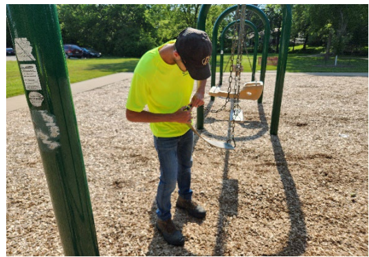
Monthly playground inspections and repairs.