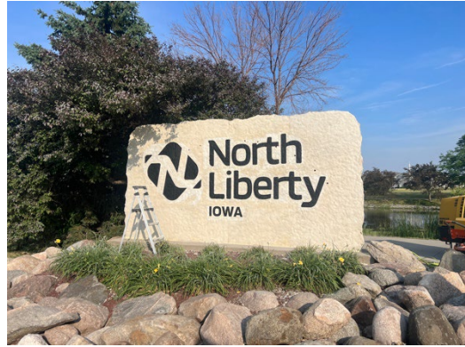
West Penn Street Welcome Sign with our new City logo.