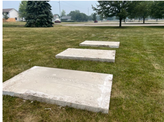
Penn Meadows Park old shelter concrete pad cut up into rectangles and will be repurposed on future park bench installations.