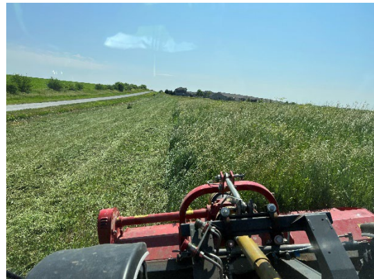
Low maintenance detention pond mowing.