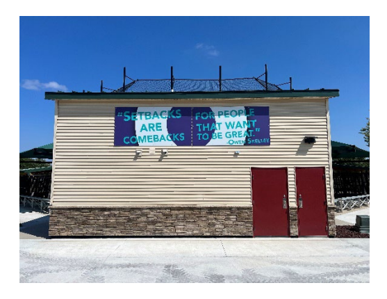
Owen Skelley Field new signage installation in preparation of the August 19<sup>th</sup> field dedication.