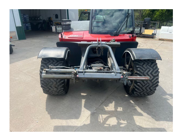
Aebi TT280 tractor front lift frame repair.