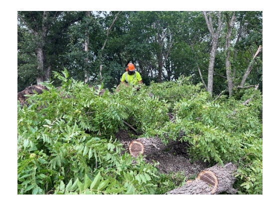
Fire station tree trimming and Beaver Kreek Park tree removal.