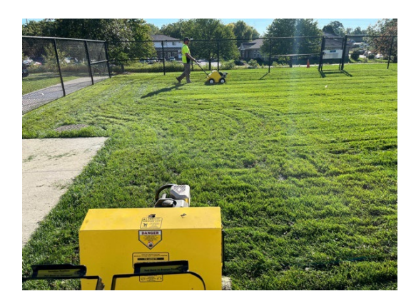
Pool turfgrass aeration maintenance.