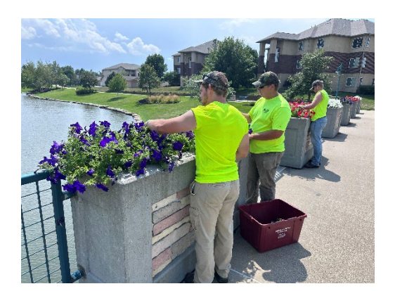
Landscape watering and planter box maintenance.