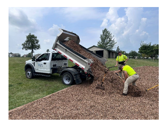
Quail Ridge Park Playground.