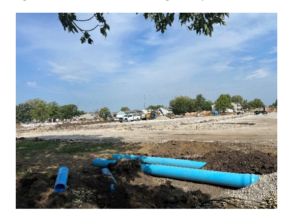
Penn Meadows Parking Lot project progress.