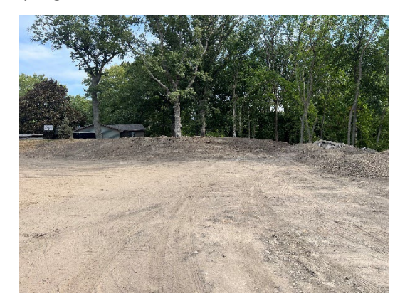
Fill dirt from the Penn Meadows Parking lot project used at Red Fern Dog Park for berm addition and enhancement.