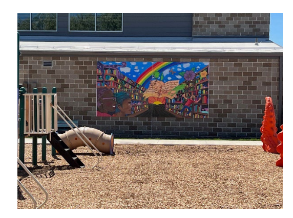
Mural installation in preparation of the August 17<sup>th</sup> mural unveiling reception.