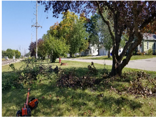
Tree trimming and removals at Cornerstone Park and Stewart Street right-of-way.