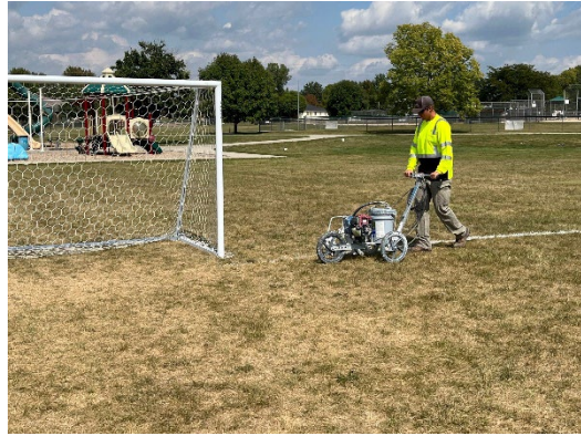
Weekly soccer field line painting.