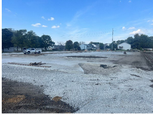
Penn Meadows Park parking lot improvements progress.