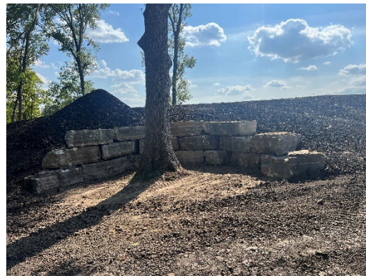
Red Fern Dog Park berm enhancements.