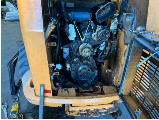
Case Skid Steer repair.