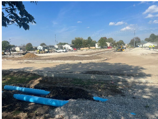
Penn Meadows Park parking lot improvements progress.