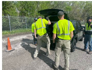
City cleanup day on April 27 th .