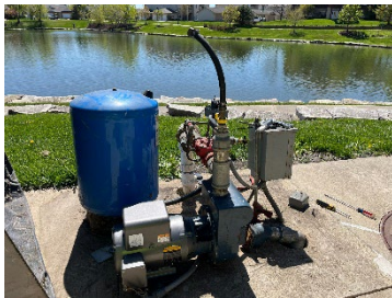
Irrigation pump replacement at Liberty Centre Pond.