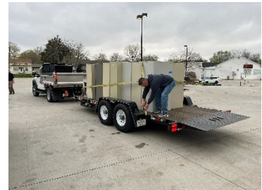
City Hall moving week.