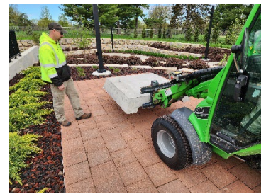
Herky on Parade concrete base pickup in Kalona and placement in North Liberty.