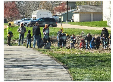
Muddy Creek Clean-up on April 8 th .