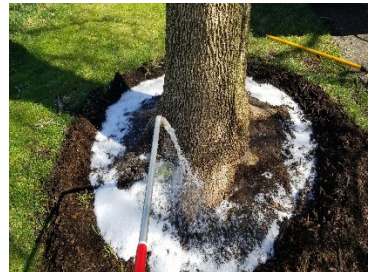
Ash tree EAB treatment.