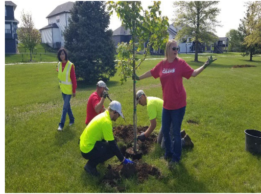
MidAmerican tree planting at Penn Meadows Park on May 5 th .