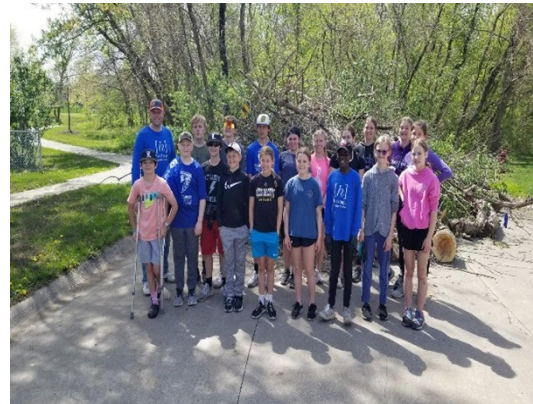
Heritage Christian students "Service Day of Work" at Penn Meadows Park & Cornerstone Park.