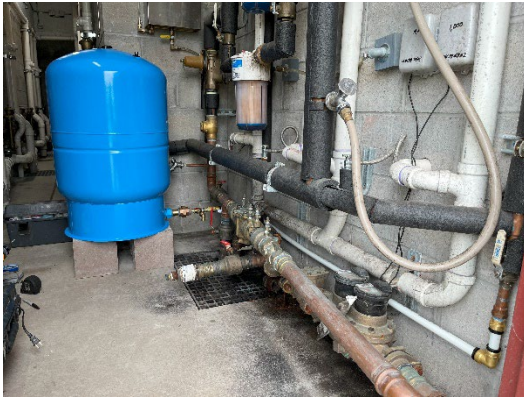
New pressure tank at Penn Meadows restroom facility.