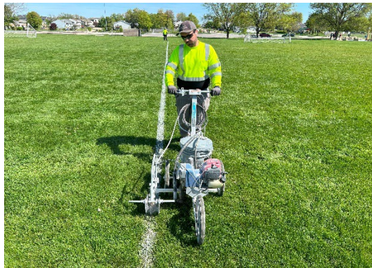
Ball field and soccer field maintenance.