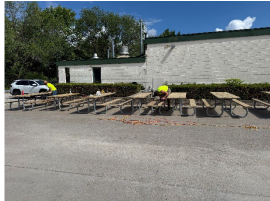
Picnic table refinishing.