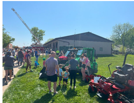
Parks Department staff & equipment at the "Remarkable Rigs" event at the fire station on May 10 th .