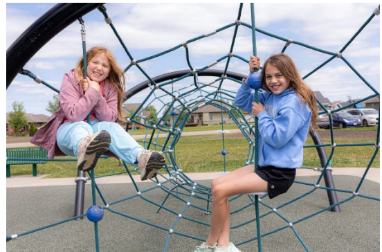
May 17 th Playground Crawl event.