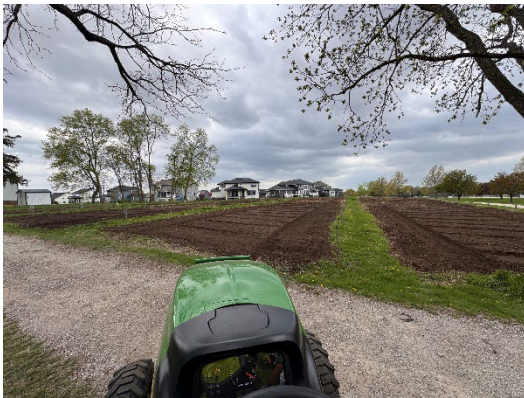
Community Gardens prep.