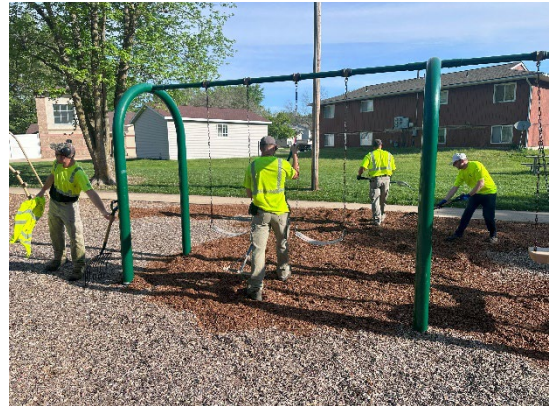
Parks Depart. adding safety surface to our playgrounds in preparation for the playground crawl.