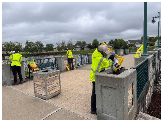
Liberty Centre Park planter boxes planted with annual plants.